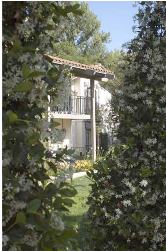
Westlake Village Inn