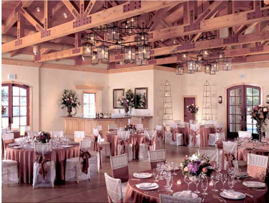
The Lodge at Sonoma

Get Married In The Wine Country; Ceremonies, Receptions & Parties.