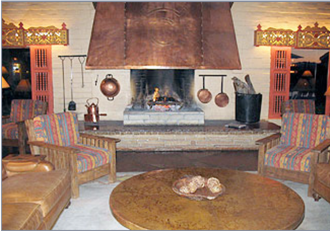
It's cowboy country with Rancho De Los Caballeros, a must-see site.

complex and extraordinary, though it's hard to get past how beautiful his creations look.