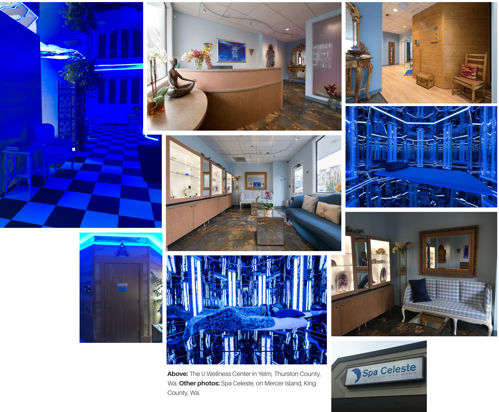
Above: The U Wellness Center in Yelm, Thurston County, Wa. Other photos: Spa Celeste, on Mercer Island, King County, Wa.

Before stepping into the room, we agree constant brain chatter is one of my “things”,