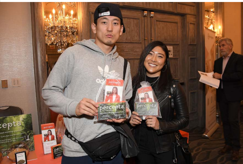
Top: The goodies celebrities took away from the Secret Room suite. Above: Mike Moh, nominated for Once Upon a Time in Hollywood . Right: Sothy's Detox Energie range.