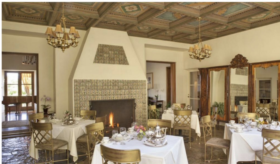
BELOW: The detailed, historic dining room.

This architecturally unique lodging retains that "Old Hollywood" exclusivity even with amenities and special touches embraced by today's choosy travelers (including a chef-driven breakfast, evening wine and hors d'oeuvres, poolside snacks, complimentary parking with a commitment to health and safety for all guests). Each of the 17 rooms between the two houses feature a queen or king-size beds, plush linens and hand-selected furniture reminiscent of the era coupled with modern necessities such as high-speed Internet, individual climate control, flat screen