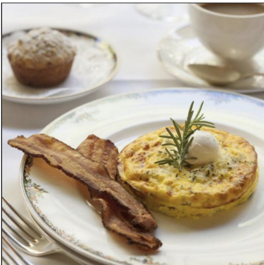
ABOVE: the inn serves a complimentary, gourmet three course breakfast daily. RIGHT, the Marion Davies room, named for the actress, features a claw footed tub, fireplace, and view, to name a few. BOTTOM RIGHT, the dining room patio beside a lush, 50 foot waterfall.