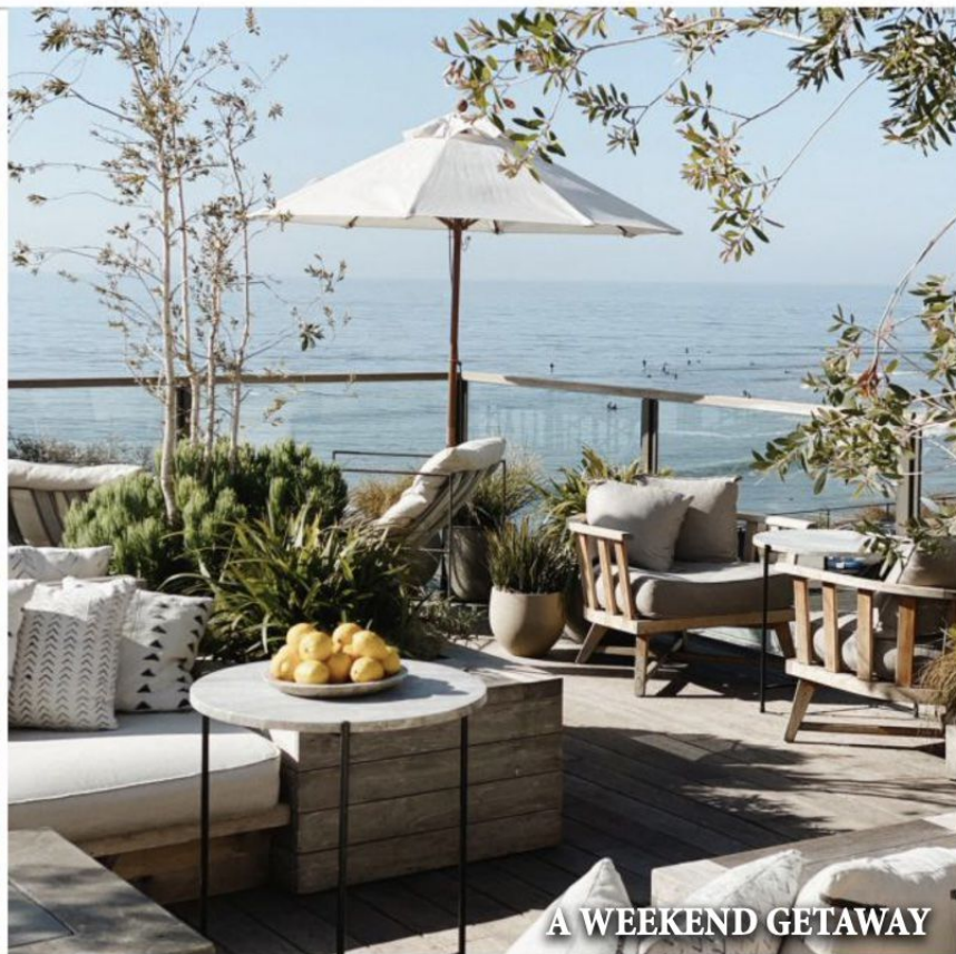
A WEEKEND GETAWAY