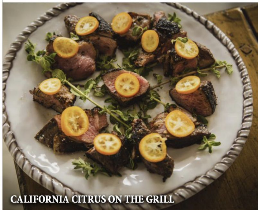
CALIFORNIA CITRUS ON THE GRILL