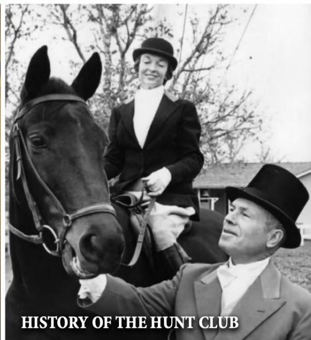
HISTORY OF THE HUNT CLUB