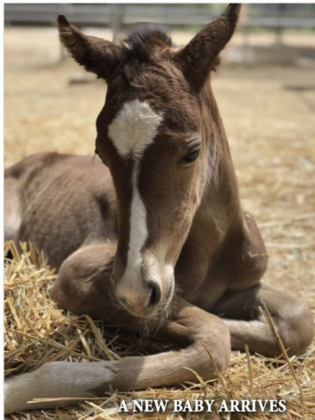
A NEW BABY ARRIVES