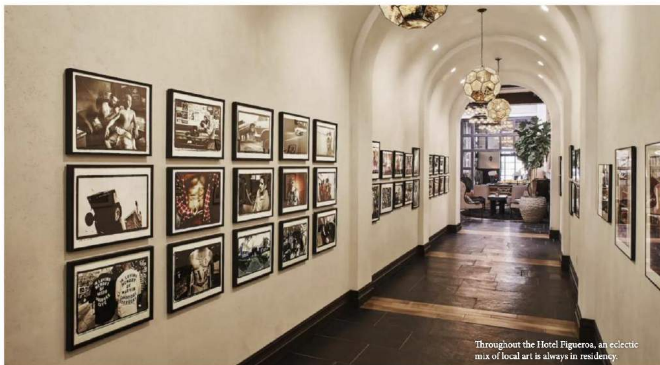
Throughout the Hotel Figueroa, an eclectic mix of local art is always in residency.

That's the way things were when the Hotel Figueroa opened its doors in 1926, as a safe but stylish place for women coming to the city to find their future and fortune. Making this even more of a landmark is the fact that the hotel was originally opened by the YWCA operated by women who understood their guests' needs and wanted to bridge the gap between making the place both a home-away-from-home and a jumping off point into a modern L.A.--whether it was for a vacation or for good. It was the dawn of American suffrage, when women at last had won the right to vote yet were still prohibited from checking into most hotels without a male chaperone. So much of what attracted the hopefuls to L.A. was within reach.