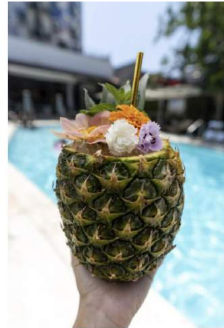
OPPOSITE: (TOP) The "Tia Rosa" signature cocktail blossoms at La Casita. (BOTTOM) Hotel Figueroa's California Spanish architecture, tucked amid downtown is as quintessential L.A. as it gets.