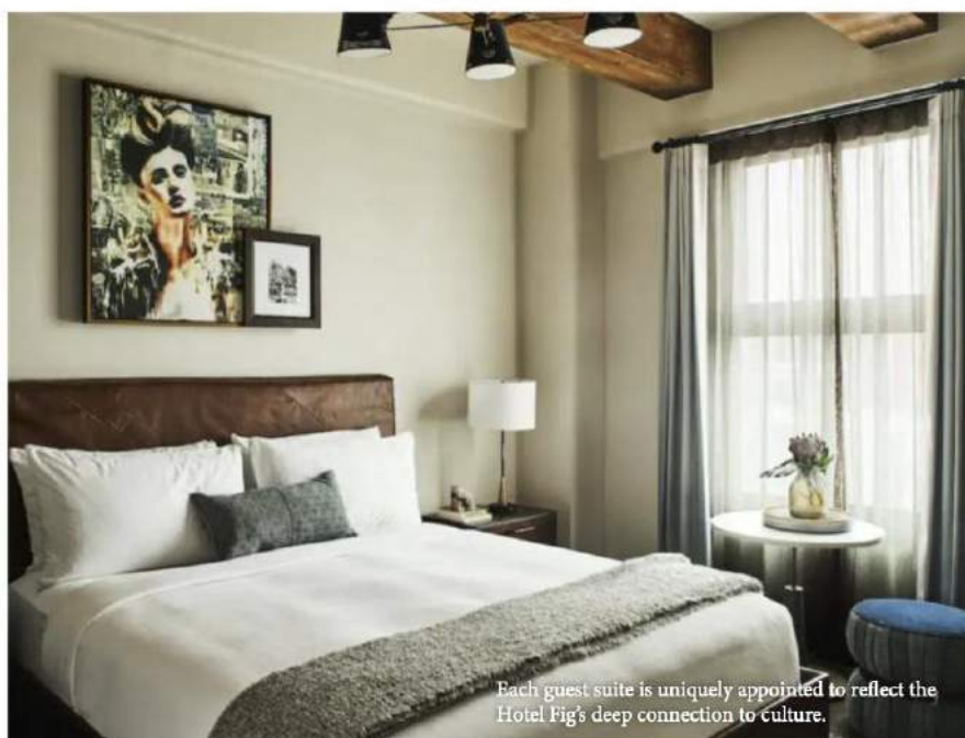
Each guest suite is uniquely appointed to reflect the Hotel Fig's deep connection to culture.

While the lobby's green, botanical backdrop is a definitively 21st century