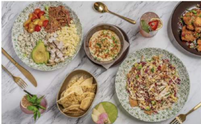
LEFT: Cafe Fig's All Day Spread is a fusion of culinary influences.