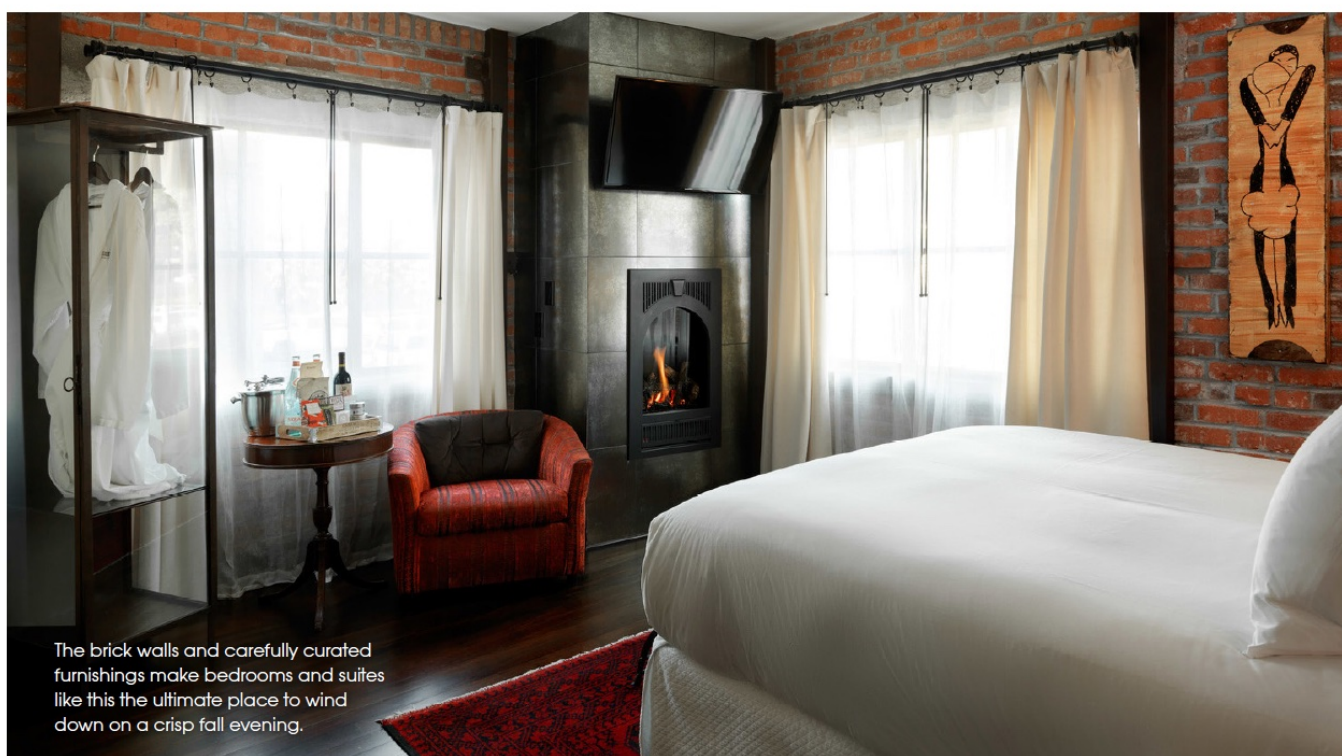
The brick walls and carefully curated furnishings make bedrooms and suites like this the ultimate place to wind down on a crisp fall evening.