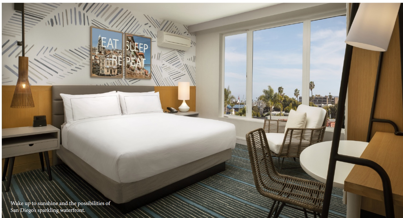
Wake up to sunshine and the possibilities of San Diego's sparkling waterfront.

As leisure travel around the world resumes, it's fitting that The Monsaraz San Diego, part of Hilton's Tapestry Collection boutique hotel division, debuted this past summer as the area's first new property in the area in over a decade. The Monsaraz opened its doors right after Southern California travel was allowed to make its comeback. However, what makes the new hotel's debut exciting is that it translates the Southern California vacation into something that's at once international and familiar, sophisticated yet laid back, and tailored to the area's geographical attributes... all things that speak to the