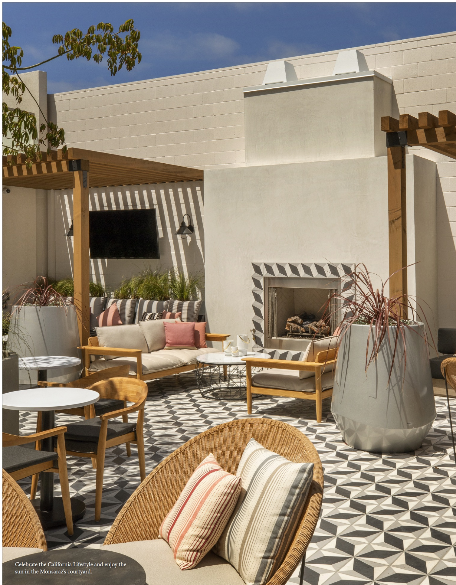
Celebrate the California Lifestyle and enjoy the sun in the Monsaraz's courtyard.