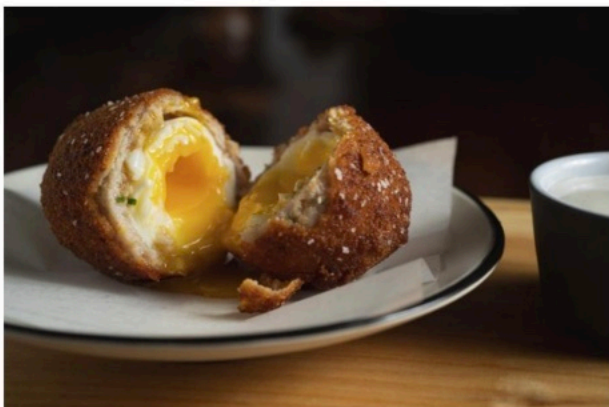
TOP: Cape Rey's breathtaking gardens as the sun goes down.

Cape Rey Resort Hilton and Park Hyatt Aviara are perfect for the occasion. Both resorts, in very different ways, hit the sweet spot between on-site amenities and location.