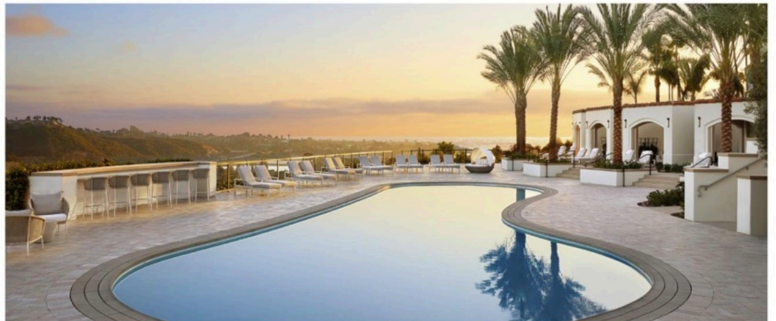
BOTTOM RIGHT: Take in the picturesque sunset from Cape Rey's adult pool.