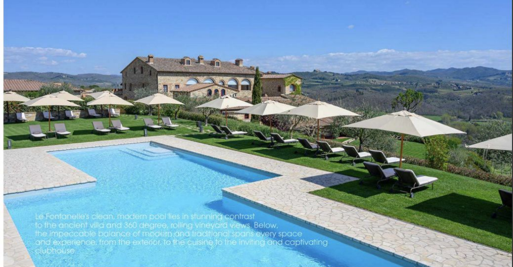
Le Fontanelle's clean, modern pool lies in stunning contrast to the ancient villa and 360 degree, rolling vineyard views. Below, the impeccable balance of modern and traditional spans every space and experience, from the exterior, to the cuisine to the inviting and captivating clubhouse.