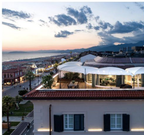
Above, the rooftop terrace/restaurant at Hotel Plaza E De Russie, Viareggio, Italy.