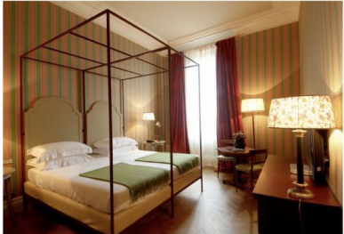
Antica Torre di Via Tornabuoni 1 stands at the intersection of Florentine history, culture, cuisine and shopping. The medieval building houses timeless style, thoughtful comfort, and superb interpretations of classic Tuscan Cuisine.