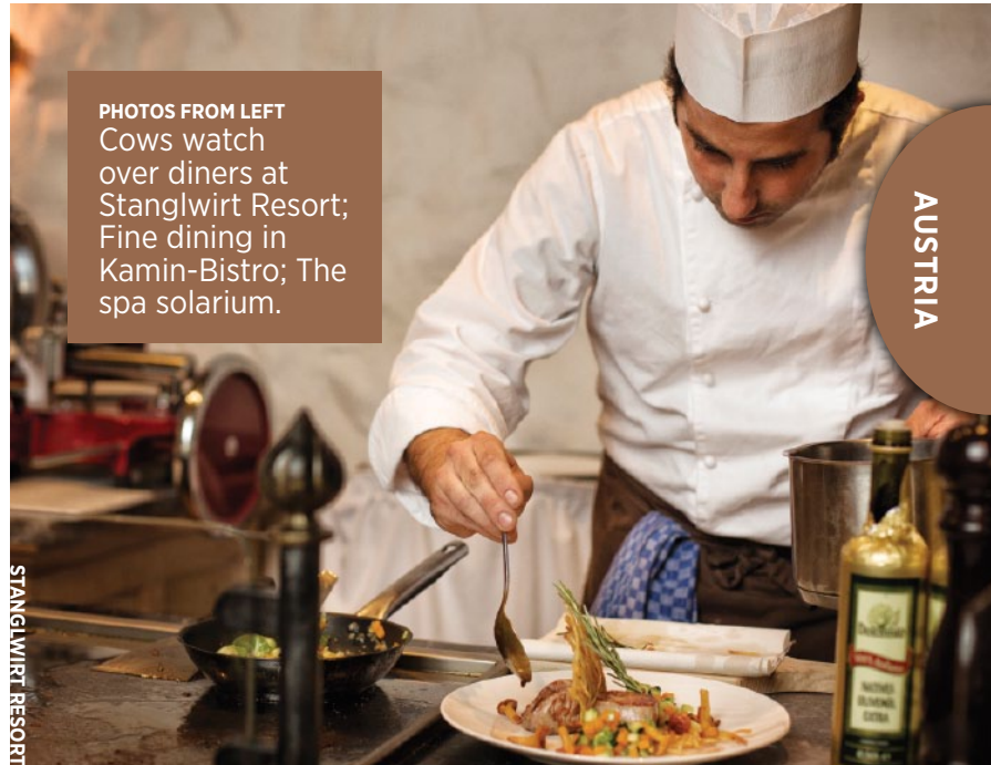
PHOTOS FROM LEFT Cows watch over diners at Stanglwirt Resort; Fine dining in Kamin-Bistro; The spa solarium.